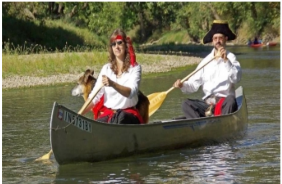
Pirates with Sea Dog

The paddlers were then able to stow their boats and gear in time to settle down to snacks and refreshment on tables strewn with doubloons and necklaces. Over 130 people attended the catered dinner. The costumes of the party guests were even more impressive and you might wonder if some people just might make their living as pirates. How else would someone have a bright orange pirate outfit . . . ?