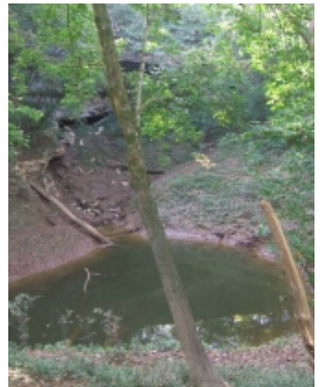
Wesley Chapel Gulf Sinkhole

The Lost River was scenic but we quickly encountered the challenges of a river that is not often paddled. Blow down from storms generated by recent