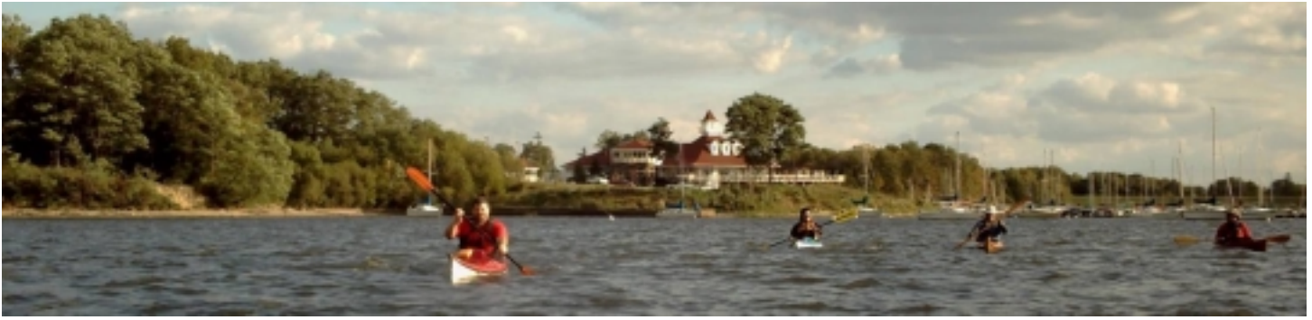
Final Tuesday Paddle of the year at Eagle Creek