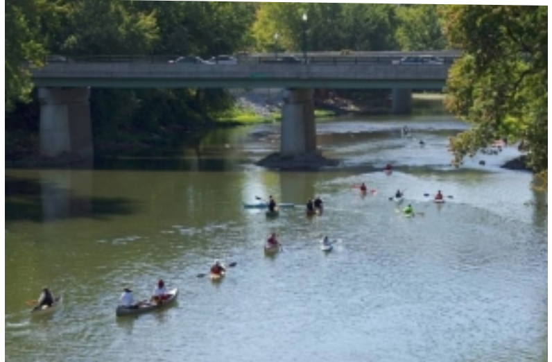
Flotilla leaving Put-In

It was a roaring time on the old White River as the Paddler's Pirate Flotilla set forth from Forest Park Public Access Site in Noblesville and wound their way down to "Pirate Cove" at Northern Beach in Carmel. About 76 paddlers made this the largest river-based pirate invasion of Carmel in recorded history. Every type of boat was present – touring, recreational, inflatable, and whitewater kayaks as well as solo and tandem canoes. Many boats carried particularly unsavory pirate types as well as beautifully-donned female pirates. Some canoes and kayaks