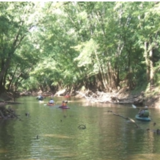
Paddling down the Lost River

hurricanes blocked us frequently and older logs created an obstacle course. It was a challenge met by all present with laughter and a helping hand...which was a necessity given the circumstances. Of course trying to figure out how not to have to portage, in order to avoid the 'shoe sucking' mud, was high on our priority list. People were very creative and the unique solutions would have made a good picture if anyone had had the time to take any.