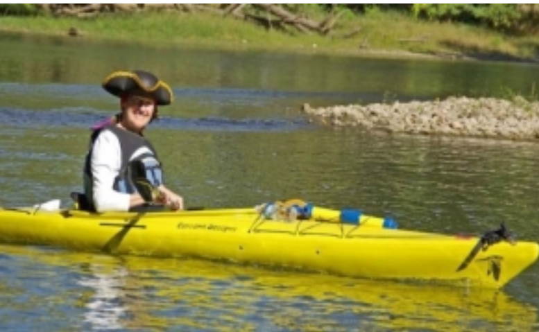
Pirate of the White River

sported the Jolly Roger, parrots on gunwales, and other pirate rigging and decorations. The fleet was supplemented by about 13 boats rented from the White River Canoe Company located about 100 yards downstream from the put-in in Noblesville.