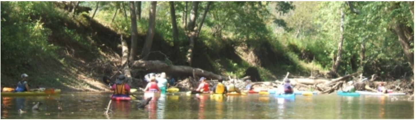
Waiting to get through a narrow channel at a major blockage