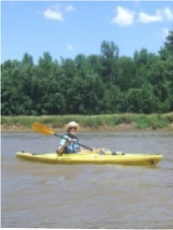
Wabash River—July 2008

We are now building the 2009 HCC schedule and are looking for Trip Sponsors for the 2009 paddling season. Let me digress. flatwater is NOT whitewater – you need to go out of state for that. Flatwater is NOT open water/sea kayaking – you mostly need to go out of state for that. Flatwater is our Indiana creeks, streams, rivers and lakes! And we want to paddle them all: north, south, east and west.