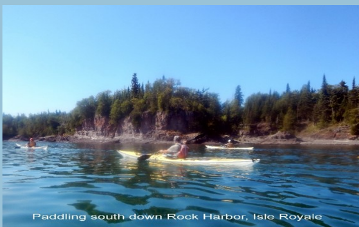
Paddling south down Rock Harbor, Isle Royale