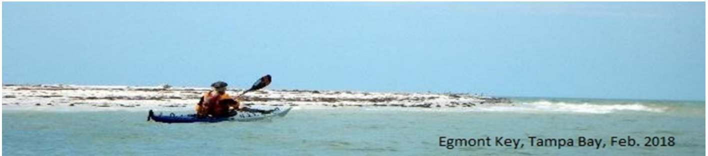
Egmont Key, Tampa Bay, Feb. 2018