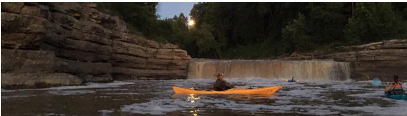
Cataract Falls Full Moon Paddle 2017