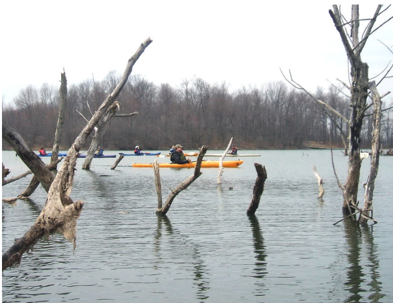
Summit Lake, March 2009