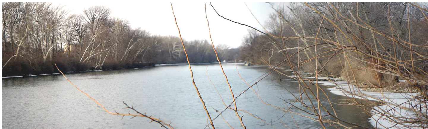
White River – Looking North from Broad Ripple Park, Feb. 16, 2011