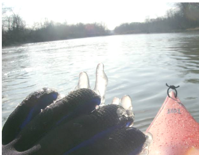
Ice on Gloves—New Year's Day, 2010