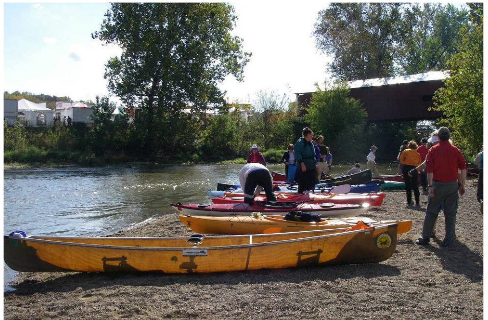
Lunch at Mansfield

Thanks to everyone who has helped me do the cleanups and the trips on the Raccoon. It has been fun, but I am not getting any younger. I will probably paddle at least one day if the trip gets picked up by someone else.