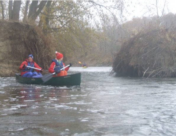
Paddling through channel formed by Fallen Tree

Despite the gray day, it was wonderful to be 'on the river' even if we only saw the eagle nest and not the eagle. The White River provided a good end to a fun season of paddling.