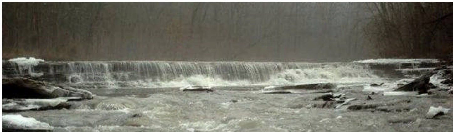
Pipe Creek near Metamora—December 26th, 2008